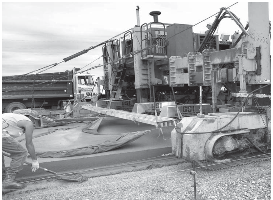
GOMACO Smoothness Indicator (GSI)