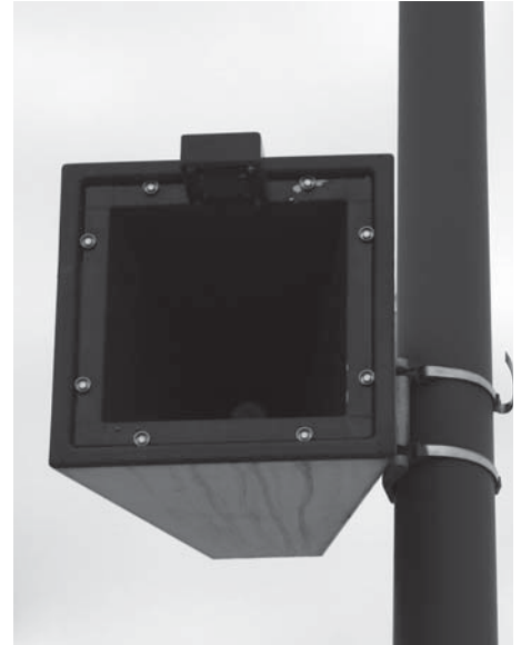
A wayside horn is a one-to-one replacement for a train horn. It is not required for a quiet zone.

Gillespie and Howe recommend reading the final rule for full details. See Appendix C of the rules for guidelines on establishing quiet zones. The final rule is available on the web at www.fra.dot.gov/us/content/1318 . This site also includes links to the FRA's quiet zone calculator. See the Iowa DOT's list of railroad contacts for quiet zone issues at www.iowarail.com/pdfs/quietzonerrcontacts.pdf . ■