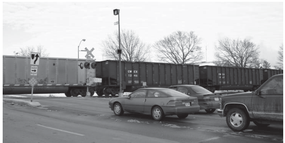
Having gates and lights at a railroad crossing is not enough to qualify that crossing for a quiet zone.