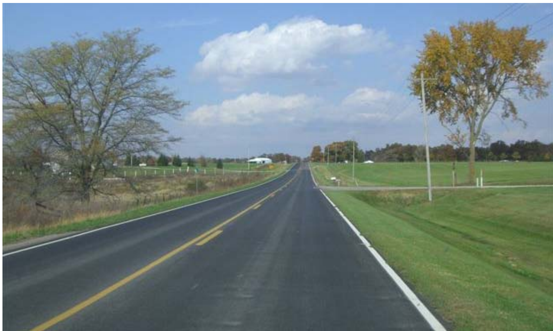
Figure A.2. Pavement markings on County Road H-46