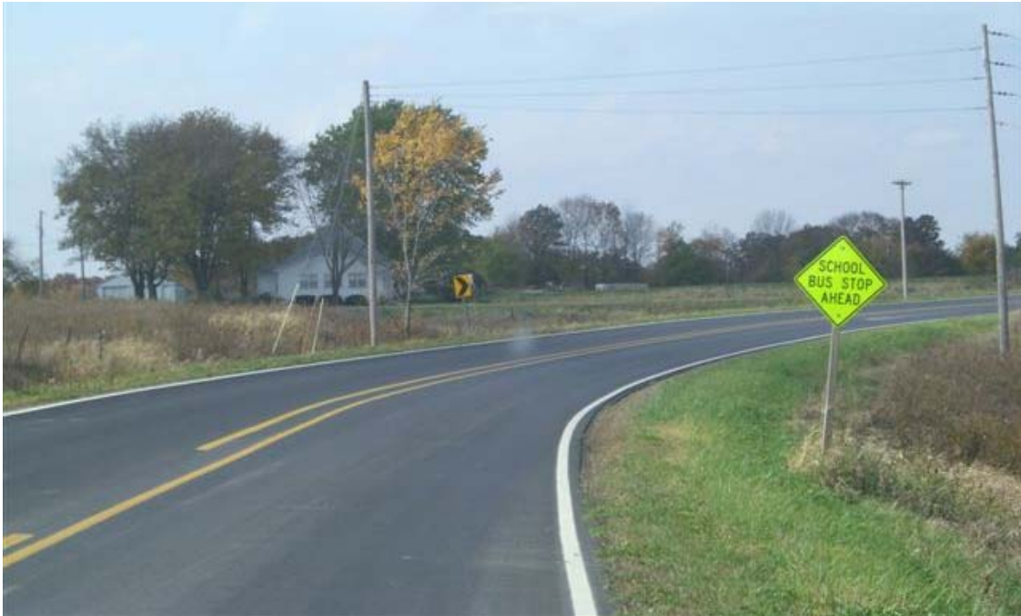
Figure A.1. School bus warning sign and chevron along horizontal curve at Palm Boulevard intersection