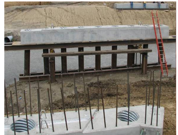
Precast abutment and pier cap in place at the Boone County bridge site