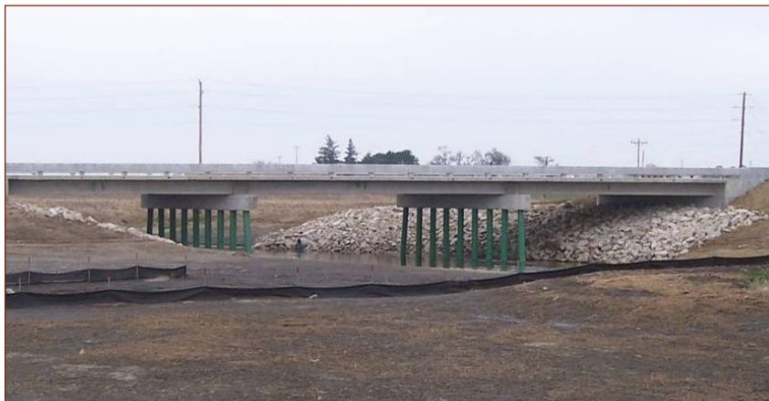
Completed bridge over 120th Street, Boone County