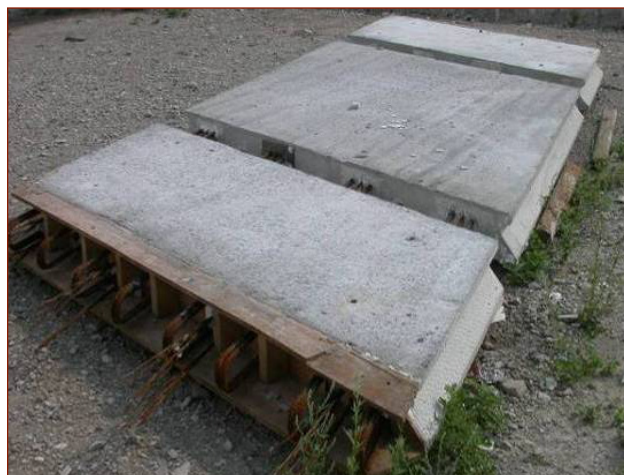
Full-depth precast concrete bridge deck panel used in the Boone County bridge