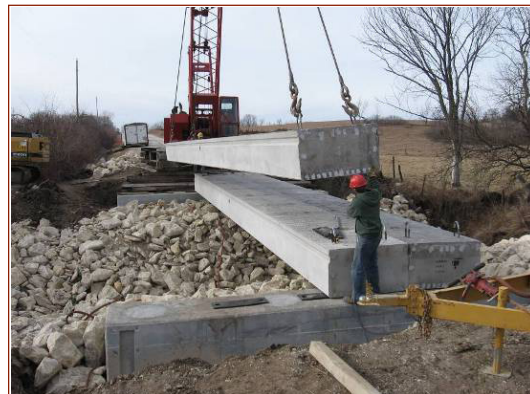
Placement of a precast box girder at the Madison County bridge site