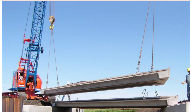
Using a crane to position a precast deck panel at the Mt. Vernon Road Bridge in Black Hawk County