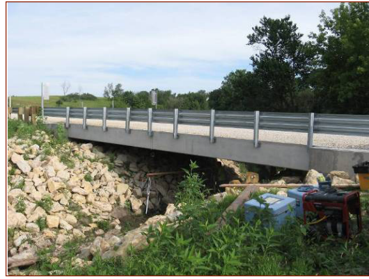
Completed box girder bridge in Madison County