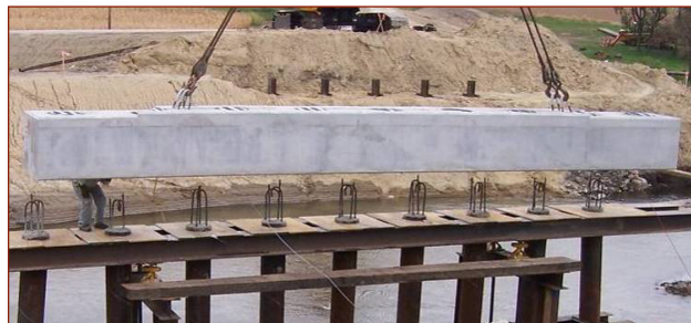
Precast pier cap lowered into place at Boone County bridge site