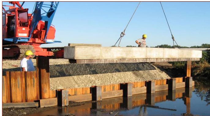
Placing a precast concrete abutment cap