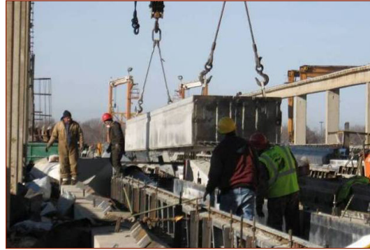
Fabrication of a precast box girder for the Madison County bridge