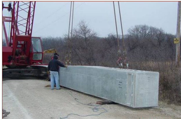
Precast abutment cap at Madison County bridge site