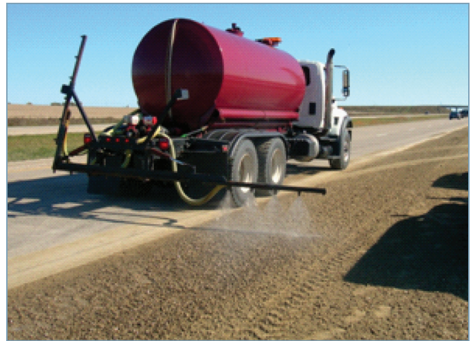
Spraying calcium chloride on shoulder surface