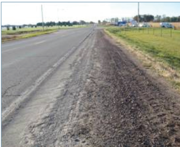
DUSTLOCK performance on stable granular shoulder material

Efforts to eliminate edge ruts are important for several reasons. Granular shoulders with rutting and drop-off may contribute to drivers losing control and running off the road. Possible results are property damage, injuries, and/or fatalities.