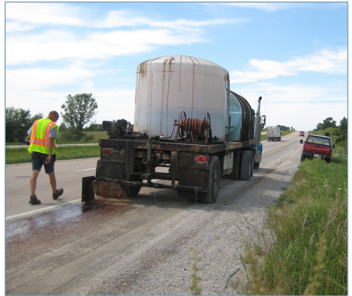
Spraying DUSTLOCK on Test Section V