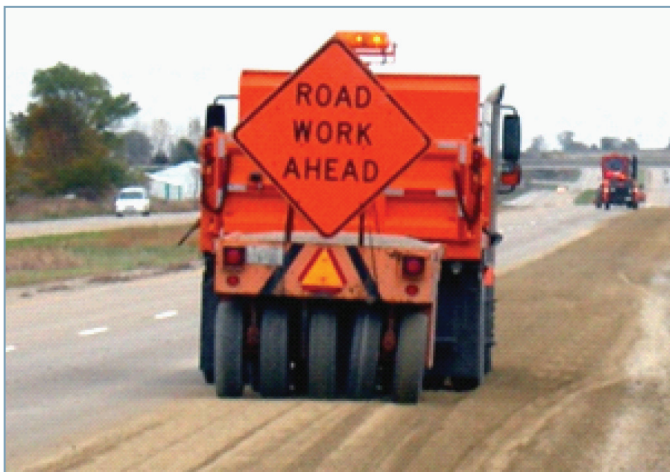
Pull-behind compactor takes too much time to safely turn for additional passes

Therefore, it seems likely that edge ruts develop from a combination of vehicle off-tracking and time elapsed between maintenance cycles, rather than defects regarding original geometry and material gradation or from structural weakness.