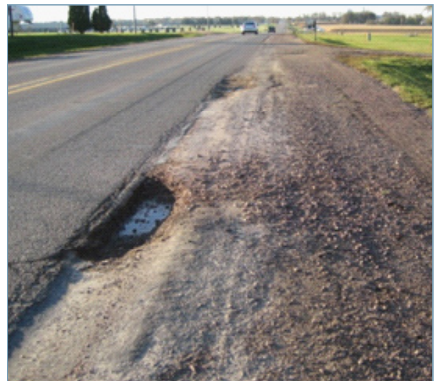
DUSTLOCK performance on unstable granular shoulder material