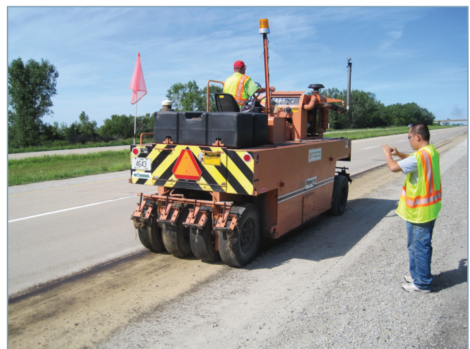
Bi-directional compactor allows enough passes to be made quickly enough to compact and stabilize reclaimed material

In particular, it would be necessary to have a pneumatic compactor that could operate bi-directionally. Typically-available, pull-behind compactors do not allow enough passes to be made quickly enough when consideration is given to the time required to safely turn the units, especially on limited access highways.