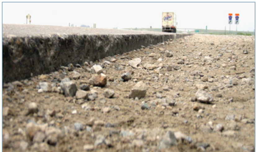
Shoulder drop off along the pavement edge on Highway 18

The drainage from the pavement surface is concentrated at the edge, softening the shoulder materials, and exacerbating the displacement process. The deeper binding materials that haven't been blown away are compacted by off-tracking vehicles into a hard crust one to three inches below the pavement edge.