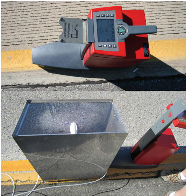
Retroreflectometer used to obtain both dry and wet measurements (with rain box used, bottom)

Retroreflectivity was sampled using a handheld LTL-X retroreflectometer under dry conditions. For rain conditions, a rain box was built according to the specifications from ASTM WK19806 (New Test Method for Measuring the Coefficient of Retroreflected Luminance of Pavement Markings in a Standard Condition of Continuous Wetting).