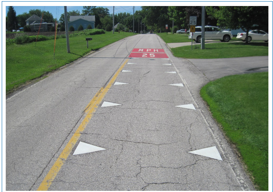
Colored entrance treatment with addition of dragon's teeth for north community entrance to Ossian

HS counters. Road tubes were typically laid just downstream of the treatment or at the treatment.