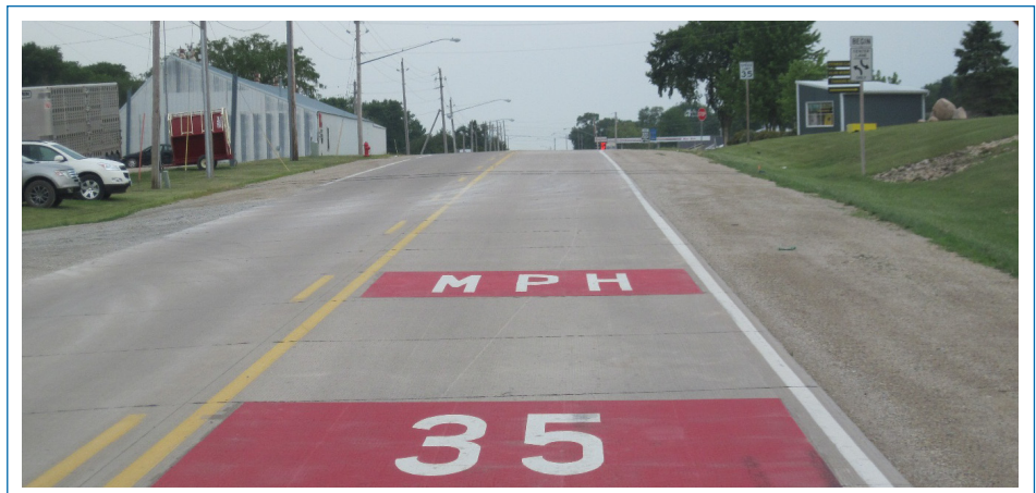
Colored entrance treatment for Jesup east community entrance

Colored surface dressing or textured surfaces are common traffic-calming treatments in the United Kingdom (UK) and are used often in conjunction with gateways or other traffic-calming measures to emphasize the presence