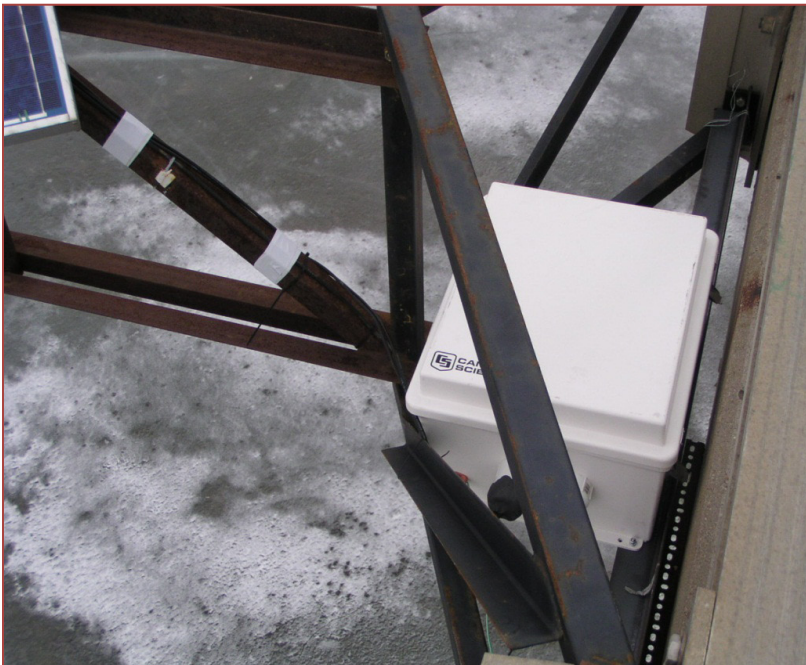
Datalogger enclosure mounted on A-frame

Once the system was functioning and providing the Iowa DOT with accurate, reliable alerts that allowed for the safe and timely closing of the structure during high wind events, there was a desire to provide the wind data information to Iowa DOT personnel as well as to the public.