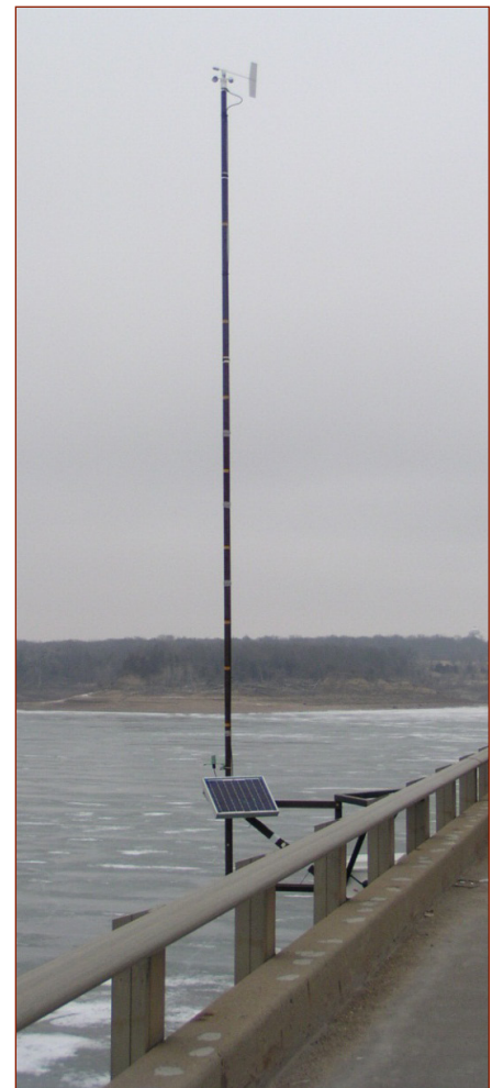
Anemometer mount at the Saylorville Reservoir Bridge

The original intent was that, once the text message is received, the bridge entrances would be closed until wind speeds diminish to safe levels.