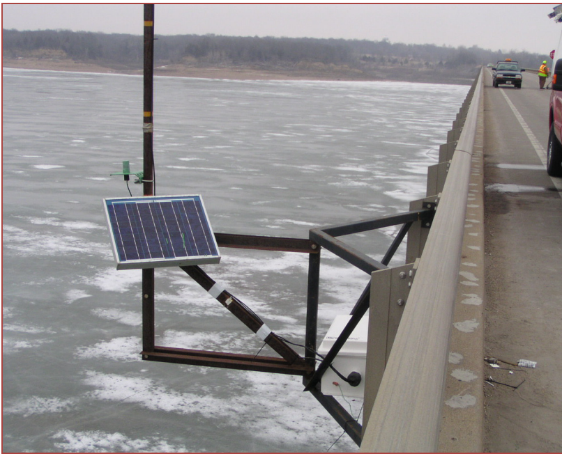
Cellular antenna and solar panel mounted on A-frame