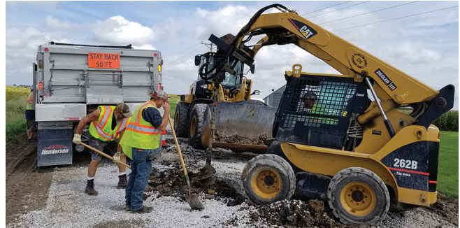
Drilling hole with skid steer-mounted power auger for aggregate columns installation, which showed relatively poor performance for this project despite good performance of smaller columns in previous projects

The 4 in. cement-treated surface section showed excellent strength performance and was relatively economical to construct. However, it did exhibit several potholes requiring application of surfacing aggregates after two years. For this method, engineers need to factor in the material and hauling costs for portland cement, as well as the cost to rent a milling attachment if they do not already own one.