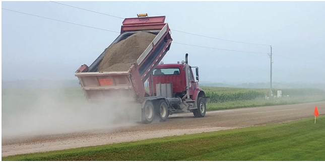
Many Iowa counties spend significant portions of their roadway budgets on granular-road maintenance and rehabilitation