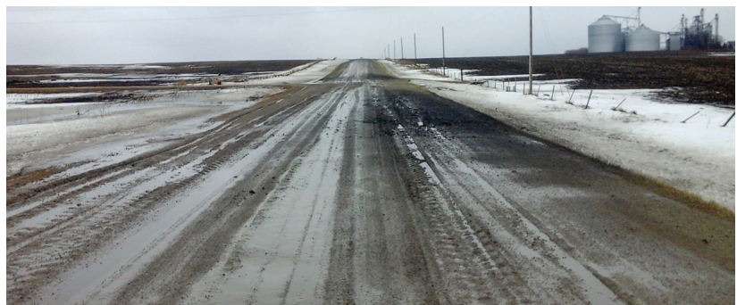
Rutting and frost boils in Howard County in spring 2019

Most of the damage occurs in the spring thaw period, when liquid water cannot drain efficiently and becomes trapped above the zone of frozen soil, causing the saturated unbound granular materials to lose strength. Moreover, heavy agricultural traffic loads in spring and low-strength aggregate sources in some regions of Iowa further compound the problems, leading some county engineers to post load restrictions or frost embargos.