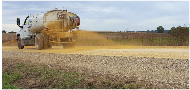
Tanker used for spreading clay slurry in Cherokee County

The field tests included falling weight deflectometer (FWD), lightweight deflectometer (LWD), dynamic cone penetrometer (DCP), and nuclear density gauge (NDG) tests. Samples of the surfacing materials were collected