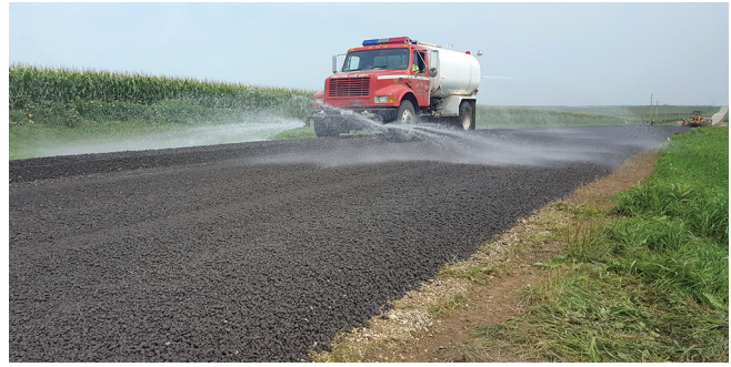
Spraying compaction water over Phoenix slag in Howard County

The 12 in. cement-treated subgrade section showed extraordinary improvements in strength and stiffness. However, it was not economical compared to the other stabilization methods examined.