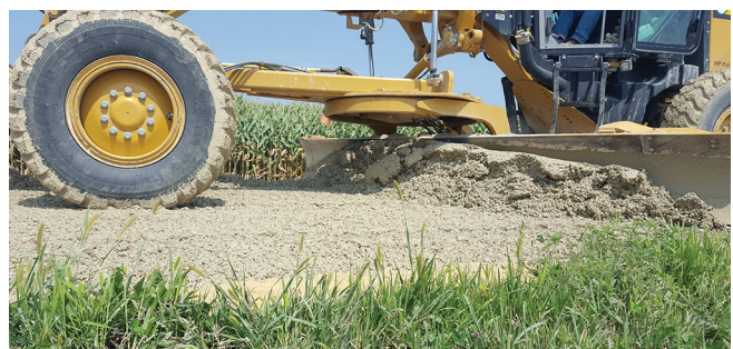
Consistency of clay slurry and aggregate near the end of blade mixing process in Washington County

on several occasions before and after each winter and were evaluated through laboratory tests including sieve analysis, Atterberg limits, compaction, shear strength, and durability tests.