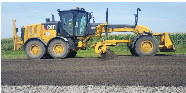
Regrading a newly placed granular-roadway surface layer of steel slag

In the previous Phase II IHRB Low-Cost Rural Surface Alternatives: Demonstration Project (Li et al. 2015), several of the identified stabilization methods from Phase I were implemented to improve the performance and minimize freeze-thaw damage of granular-surfaced roads. Test sections were constructed over a two-mile stretch of heavily traveled roadway that required frequent maintenance, and the performance of test and control sections was assessed via extensive field testing over a period of two years. Several of the stabilization methods were demonstrated to greatly improve performance and reduce maintenance costs over the duration of the Phase II project.