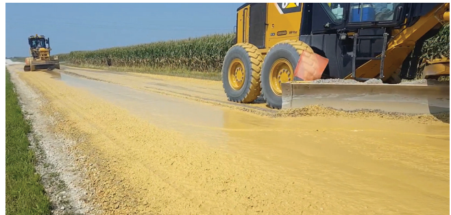
Consistency of clay slurry and aggregate at beginning of blade mixing process in Washington County