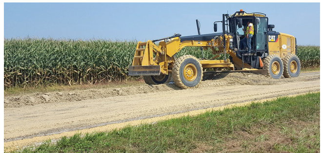
Clay slurry and aggregate near the end of the blade mixing process in Washington County